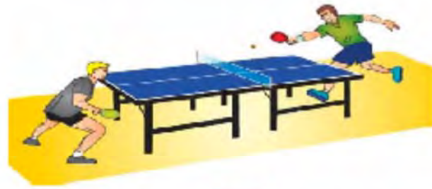
Table Tennis has started up