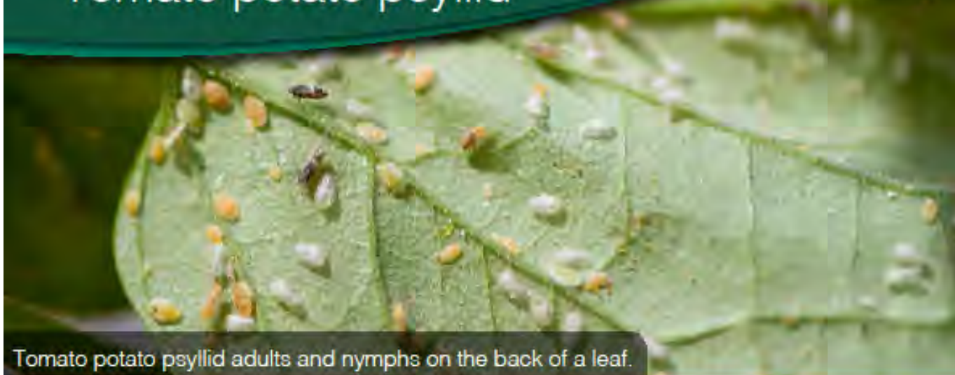
Tomato potato psyllid adults and nymphs on the back of a leaf.

Help us protect WA's horticulture industry by checking for the quarantine pest Tomato potato psyllid.