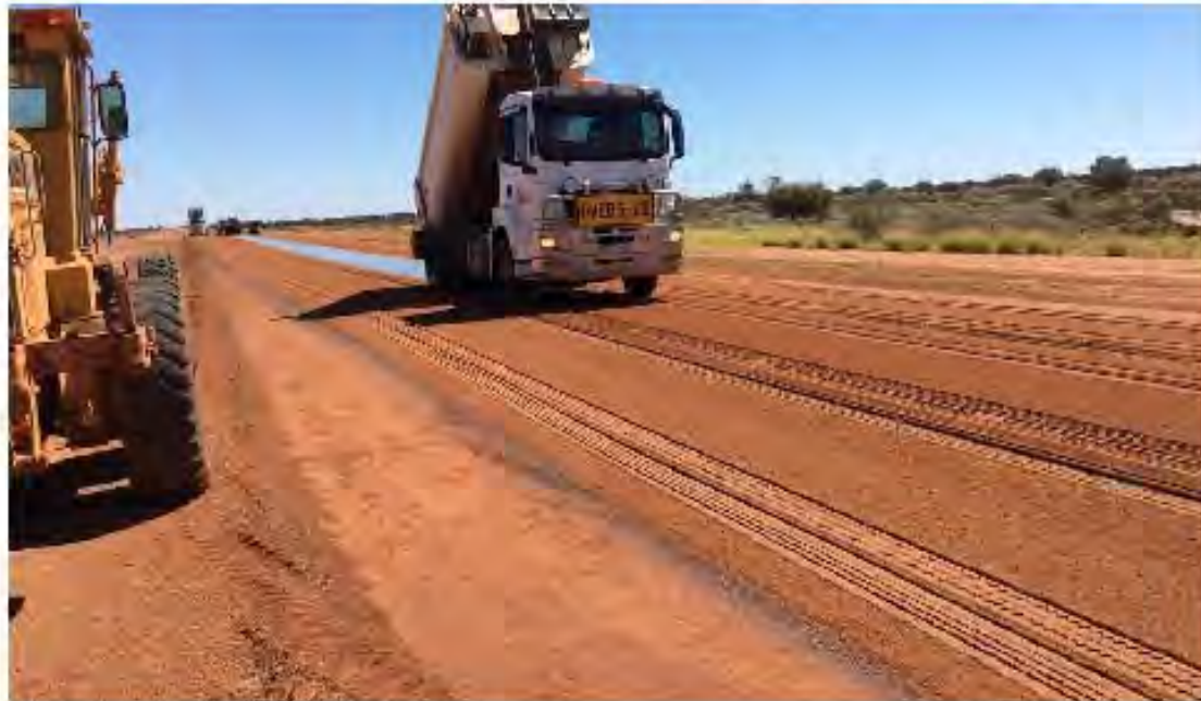
Cue-Beringarra Road receiving a sand seal.

Sealing of the six kilometre reconstructed section of the Cue-Beringarra Road has been completed. An additional six kilometres of the road was re-sealed, taking the new sand seal as far as Wyah Pool. The sand will remain on the road until it is incorporated into the bitumen surface or dispersed over time by the traffic and weather. The final stage of the project will be the addition of guide posts and a review of the signage.