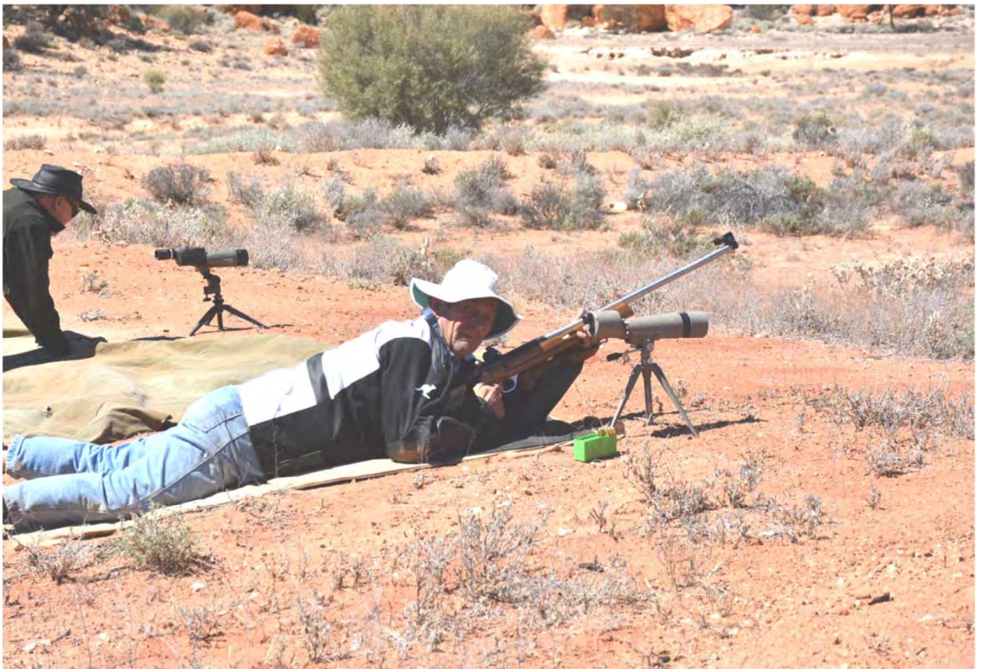
What does he mean by a washout