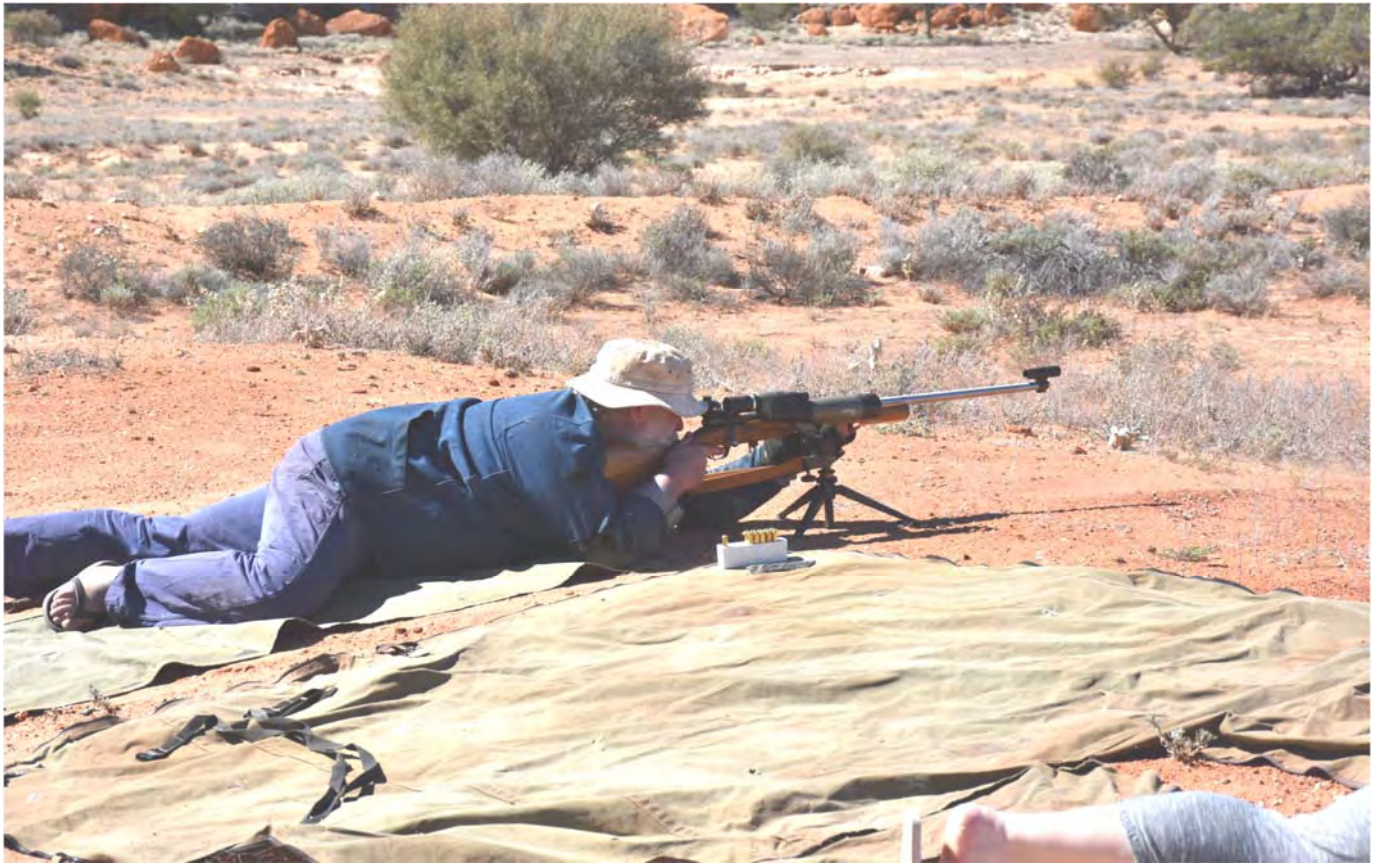
The Butcher getting serious