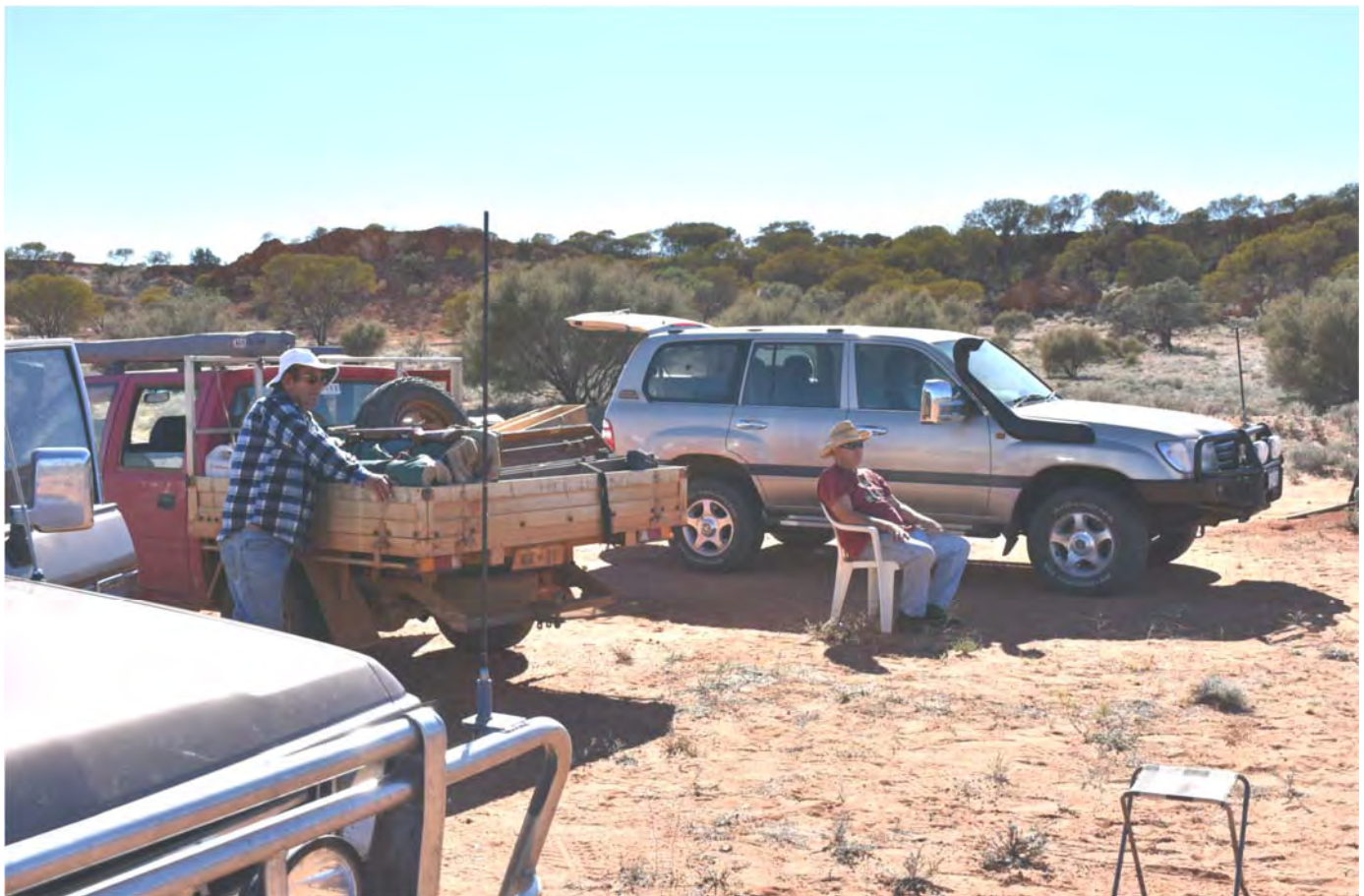
Waiting ..... Waiting