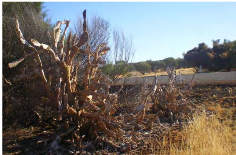
Figure 1 Dead Cactus on Gt Northern Hwy, Nov 2016.