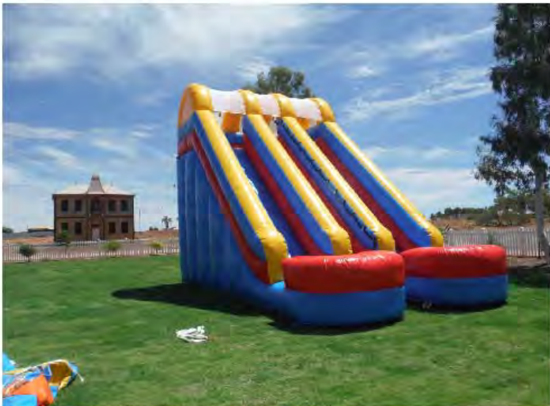
The Shire's new 18 foot wet & dry slide set up for testing in Brockman Park

After consulting with the Brockman family, a date of Saturday 22 April has been set for the official opening of Brockman Park, starting with a BBQ lunch from 12 noon which is open to all members of the community. Meat packs, soft drinks and water will be provided free of charge. BYO salads. The Shire's new inflatable slide will be set up for the kids to enjoy. Although the park has been designed with large picnic settings to cater for family gatherings, it is unlikely that there will be enough seating for everybody on the day, so bring a chair or a blanket for sitting on the lawn.