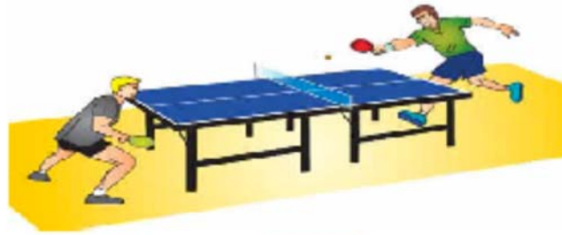
Table Tennis has started up